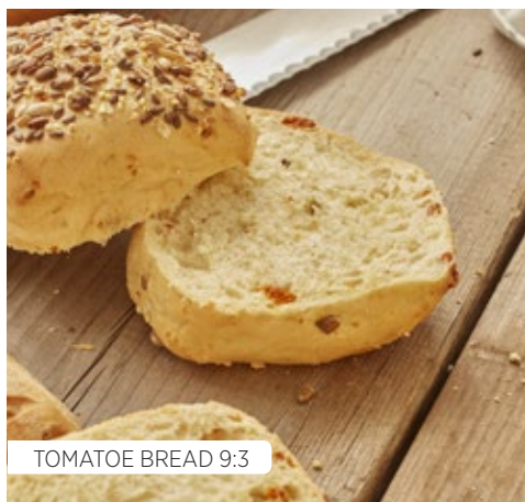
TOMATO BREAD 9:3