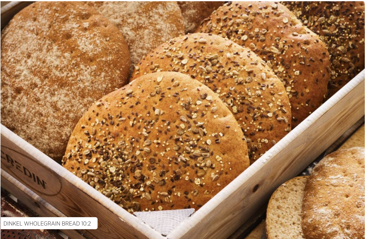
DINKEL WHOLEGRAIN BREAD 10:2