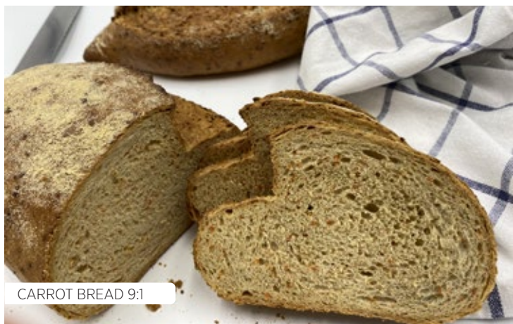
CARROT BREAD 9:1

A concentrate without salt for a little bit darker ciabatta with malty character. Contains flaxseeds, millet, wheat sourdough powder. Dosage: 10 %