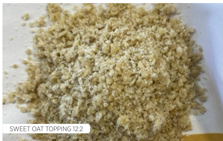
SWEET OAT TOPPING 12:2