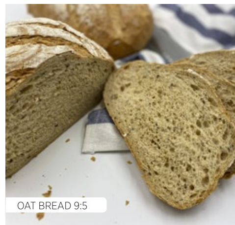
OAT BREAD 9:5