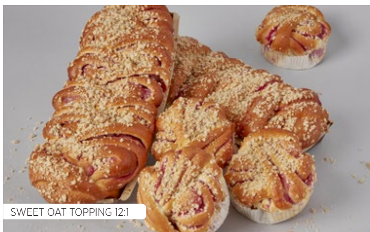
SWEET OAT TOPPING 12:1

Mix for production of chocolate cake bases and similar products. Just add eggs and water.