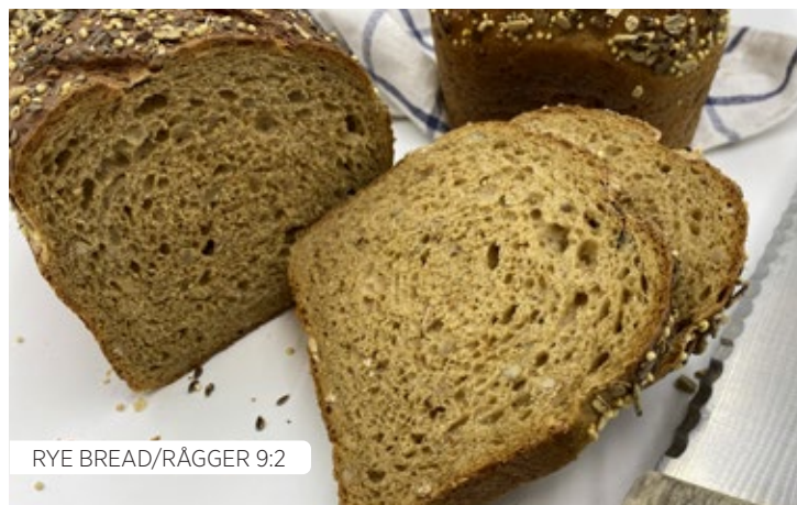
RYE BREAD/RÅGGER 9:2