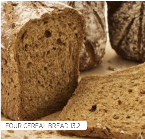
FOUR CEREAL BREAD 13:2