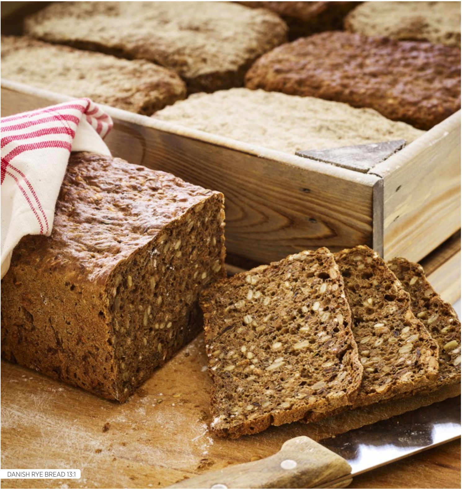
DANISH RYE BREAD 13:1