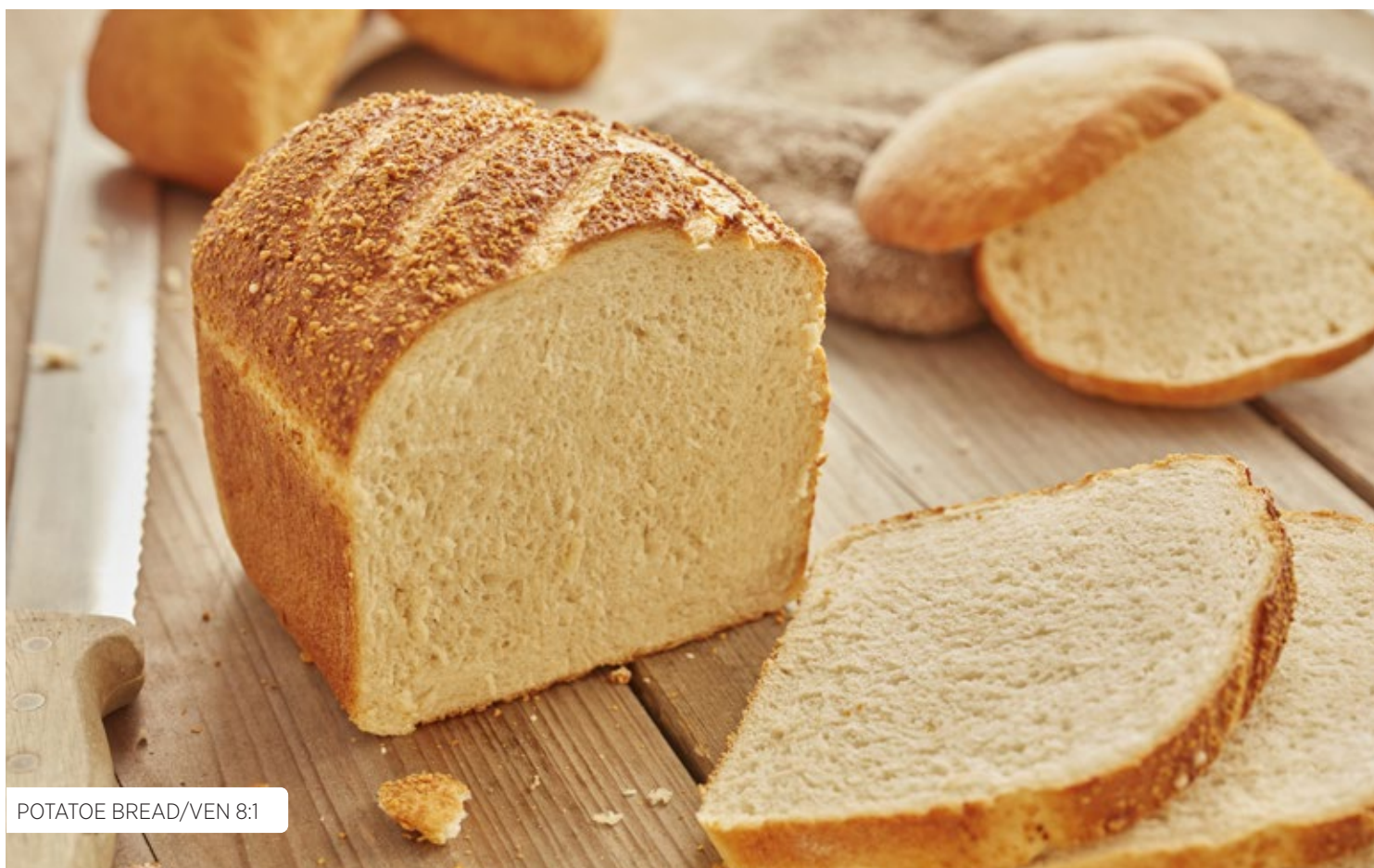
POTATOE BREAD/VEN 8:1